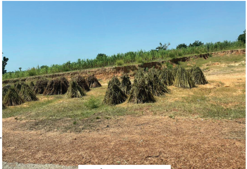
Bushes in Nigeria

Nigeria Sesame Crop harvest started at the end of August, followed by Shipments, which begin by mid -September, and the crop starts to finish by march end though the stock remains with the stockiest until July-Aug.